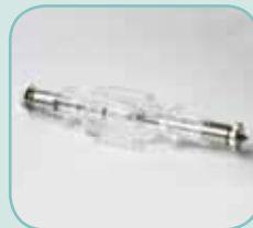
■ LX-JAS-274 Xenon UV Lamp

Model: 970 975 (B & C) 1570 1575 2070 2075 OEM: 5330-0091