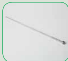
■ NPA-GIL-102 Septum Piercing Needle