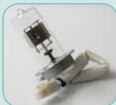
■ LD-JAS-101LL Deuterium UV Long Life Lamp

Model: 970 975 (B & C) 1570 1575 2070 2075 OEM: 5330-0091