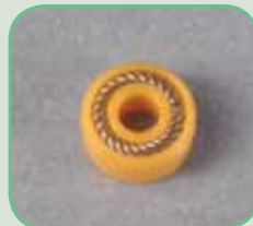
■ PS-GIL-102YW Piston Seal (Yellow) Model: 30X SC 5ml Head OEM: 400120