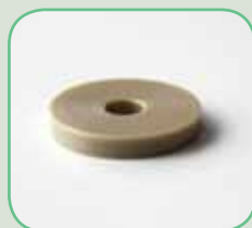
■ AG-GIL-216 Anti Extrusion Gasket Model: 30X SC & WSC 10ml Head OEM: E 50015