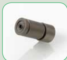
■ CV-GIL-104T CV Cartridge Outlet (Titanium) Model: 30X SC & WSC 5 10 25ml Head OEM: 3650180