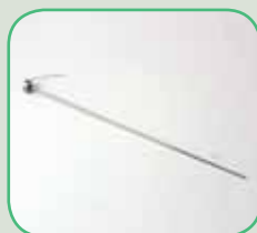
■ NP-GIL-201 Short Septum Piercing Needle - requires sleeve