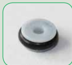
■ IPS-GIL-003 Injection Port Seal 1.5mm