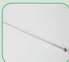
■ NSL-GIL-202 Long Needle Sleeve for NP-GIL-202