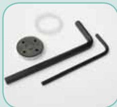
■ 7010-999 RheBuild Kit for 7010 Injection Valve