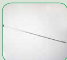
■ NP-GIL-202 Long Septum Piercing Needle - requires sleeve