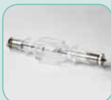
■ LX-JAS-150MO Xenon UV Lamp