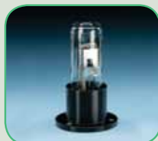
■ LD-GIL-101 Deuterium UV Lamp

Model: 115/116/117/118/119/ 151/152/155/156 OEM: 100326