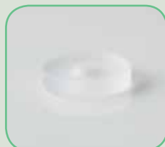
■ CW-GIL-213 CV Outlet Washer (Frit) Model: 30X SC & WSC 5 10 25ml Head OEM: E 45333