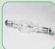
■ LX-GIL-150MO Xenon UV Lamp

Model: 115/116/117/118/119/ 151/152/155/156 OEM: 100326