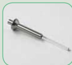
■ PA-GIL-101 Piston Assembly Model: 30X SC 5ml Head OEM: E 500008