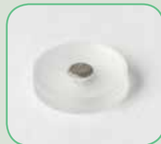
■ CW-GIL-113 CV Outlet Washer (Blank) Model: 30X SC & WSC 5 10 25ml Head OEM: E 45329