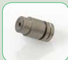
■ CV-GIL-103T CV Cartridge Inlet (Titanium) Model: 30X SC & WSC 5 10 25ml Head OEM: 3650170