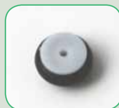
■ IPS-GIL-002 Injection Port Seal (New) PK/3