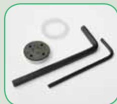
■ 7010-999 RheBuild Kit for 7010 Injection Valve