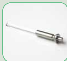
■ PA-GIL-301 Piston Assembly Model: 30X WSC 10ml Head OEM: E 50010