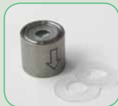
■ MK-GIL-116 Mixer Kit (New Style) 811