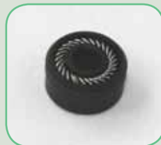
■ PS-GIL-102BK Piston Seal (Black) Model: 30X SC 5ml Head OEM: 400112