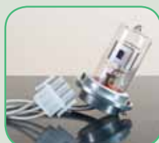
■ LD-GIL-105LL Deuterium Long Life UV Lamp