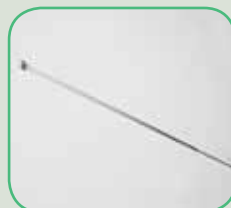
■ NP-GIL-102 Needle - 1 piece