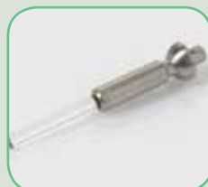
■ PA-GIL-201 Piston Assembly Model: 30X SC 10ml Head OEM: E 50009